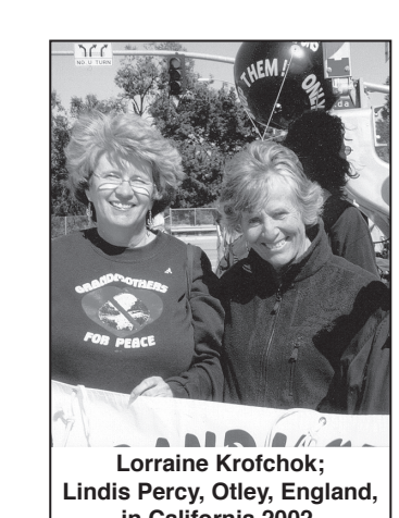
in California 2002.