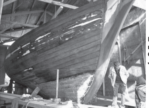
Progress is being made with the Golden Rule Project. January 2012