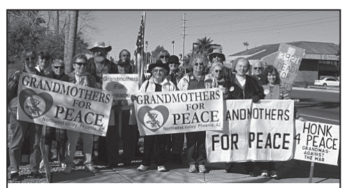
The Arizona Northwest Valley Chapter of Grandmothers for Peace proudly display their two new banners at the January 19, 2008, demonstration.