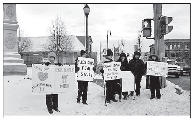
The GFP Chapter in Franklin County New York protests the Supreme Court decision in the Citizens United case. January 21, 2011.