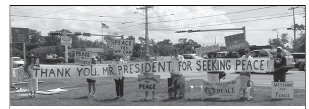
Florida Keys, Florida, GFP organized the March 21,2009, gathering for the Sixth Anniversary of the Iraq War. Veterans for Peace and other peace friends participated.