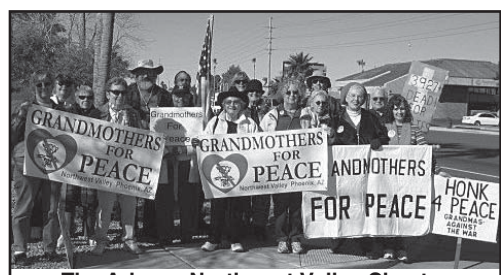
The Arizona Northwest Valley Chapter of Grandmothers for Peace proudly display their two new banners at the January 19, 2008, demonstration.

The photo of our group will put me in touch daily with what we are about. Together we have set our stake down in history and from that point, that street corner, have refused to move. ..."