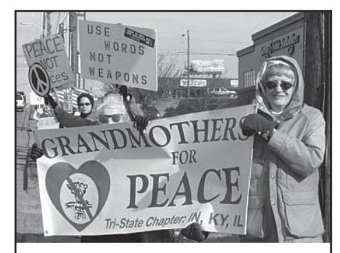
The Tri-State GFP Chapter and other groups line a busy street in Evansville, Indiana, to protest the proposed troop surge, January 27, 2007.