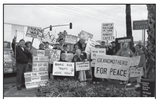
Grandmothers for Peace of Phoenix West Valley at their favorite street corner with their new, big sign, January 20, 2007.

Grandmothers for Peace of Phoenix West Valley have been demonstrating against the Iraq war since 2003, and our ranks have steadily grown to nearly one hundred. Twelve to fifteen members regularly meet along the area's main thoroughfare, although as many as twenty-five may stand together or sit with signs advocating peace.