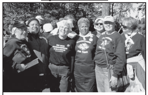
Ft. Benning, GA: Northland GFP at the SOAWatch demonstration, November 17-19, 2007