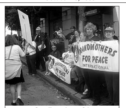
San Francisco, CA: Grandmothers for Peace September 24, 2005, Peace Rally