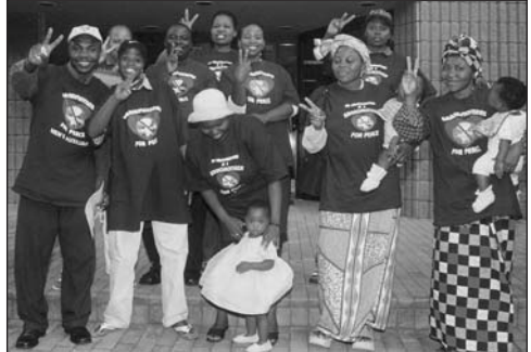
"The Grandmothers for Peace, South Africa Chapter-team, greet all of you with joy and peace on their lips!"

We are and will continue to work for the establishment of peace in this country. We deserve a world built on peace and respect for human rights – a world where people live in honor and dignity, a gun-free zone!