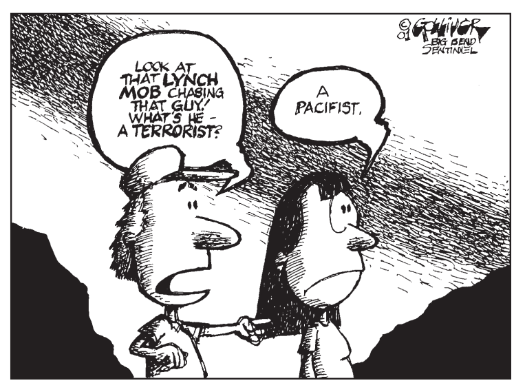
Graphic courtesy of Gary Oliver.

The proposed military spending increase — $48 billion — is more than three times the combined defense budgets of Iran, Iraq, North Korea, Libya, Cuba, Sudan and Syria, those nations traditionally regarded as "rogue nations" or "states of concern." Clearly, the United States dwarfs the rest of the world in military spending: the proposed increase is larger than the entire defense budget of every other country, except Russia ($60 billion). Source: Center for Defense Information