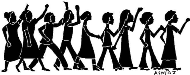
illustration: Anne S. Walker/Grace Jung - ITWC

Although thousands of women engage in year-round peace work and conflict resolution, seldom is this work recognized. The focus of May 24 th is to inform the world, home countries, cities and villages that "women refuse violence as a 'solution' to the world's problems. Women are working for a just and peaceful world, one that meets human needs, not military ones." Conflict and violence touches everyone, whether or not you live in a war-torn country. Look at the recent shooting deaths at American schools.