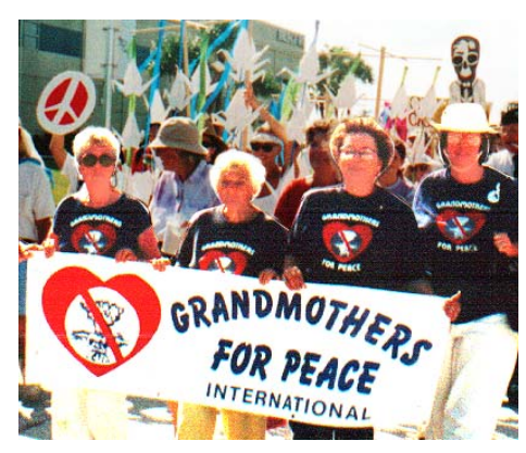
Grndmothers for Peace lead the way at Cassini protest.

• April 1970: the Apollo 13 astronauts were forced to abandon their spaceship. They were rescued from the command module that landed in the Pacific Ocean. However, the Lunar Excursion Module, or LEM, with 8.3 pounds of plutonium was not recovered. It was aimed to a different area of the Pacific – to the "deepest water we can find...an especially bottomless patch of ocean...a spot