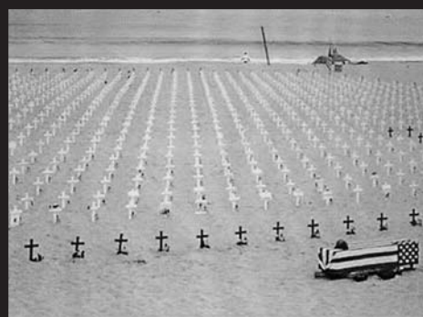
Arlington West: Santa Monica, California. A temporary cemetery erected every Sunday by the Veterans For Peace.