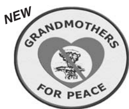
Sew-on Logo Patch

Hats on to GFP For peaceful protesting — an adjustable Baseball Cap with the GFP Logo — $11.00 each.