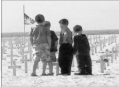
Arlington West: Santa Monica, California. A temporary cemetery erected every Sunday by the Veterans For Peace.

It has been extraordinarily well received in just a short time. Please copy it, use it, take it, distribute it and let people know they have the right to opt out their children from being interviewed by military recruiters.