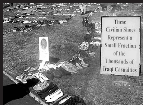
Eyes Wide Open Exhibit: Sacramento, Calif., March 2005. These few civilian shoes represent thousands of Iraqi casualties.

Arlington West is a tribute not only to the fallen U.S. soldiers, but also to the countless innocent Iraqi citizens.