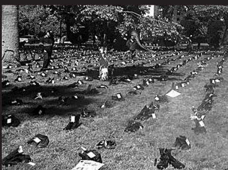
Eyes Wide Open Exhibit: Sacramento, Calif., March 2005. Each white-tagged pair of boots honors a U.S. military casualty.