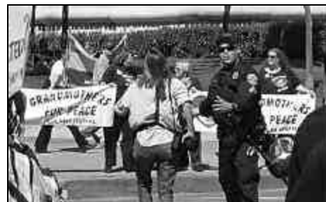
GFP International and GFP Hayward, CA., display their banners in San Francisco, CA., at the March 20, 2004, peace action.

In San Francisco, GFP International and GFP Hayward, CA, stretched out our banners on the corner of Van Ness and Grove.