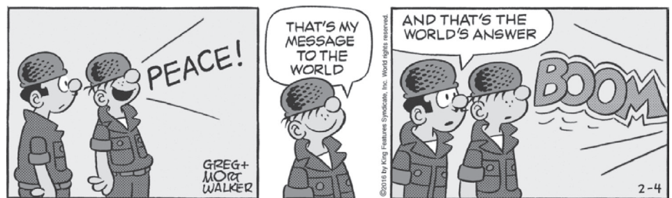
Thank you, Mort Walker, for permission to use your work.