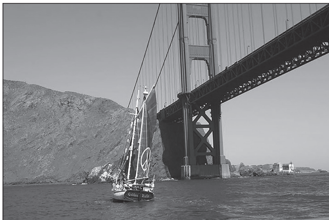
The Golden Rule at Fleet Week, San Francisco, CA October 6-11, 2015