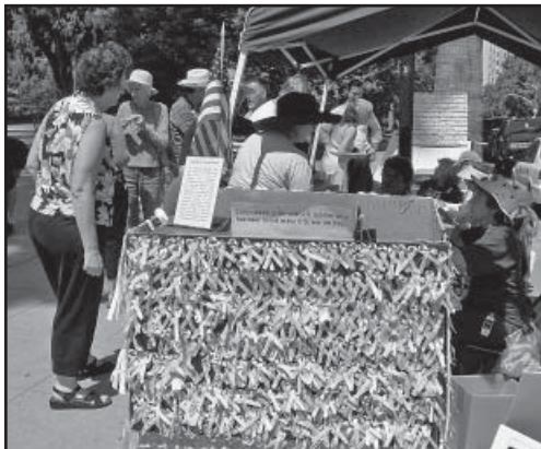
Information area with ribbon monuments to the US soldiers and Iraqi civilians killed in Iraq. Sacramento, California.

This is from the young Veteran's statement at the end of the eleven days: "... you reflect on those whose lives have been lost in this war. Think about all the pain and suffering each individual went through as their life was taken from them and the emotional anguish that his or her parents or children went through when they received the news of their loved one's passing. And then say to yourself, 'Not one more.' Never give up the fight for peace and never stop demanding an end to this war."