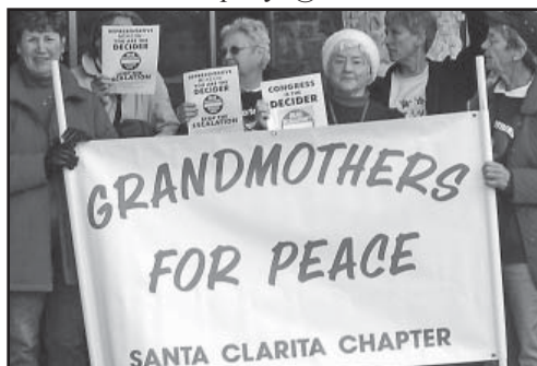
GFP Santa Clarita, CA, joined MoveOn members to present a stack of letters to U.S. Rep Howard “Buck” McKeon’s office asking him to stop supporting the escalation of the Iraq war.