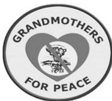
Sew-on Logo Patch