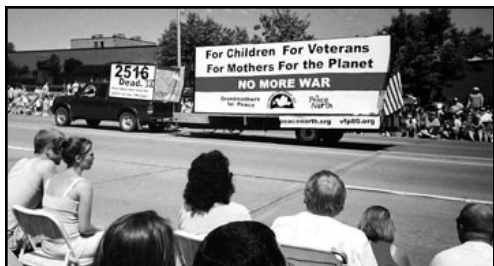
Superior, WI: The GFP Northland Chapter shared a float with Veterans for Peace, and Peace North in the 4 th of July Parade, 2006.

Our Northland Chapter banner was greatly appreciated, as no one else had anything like it. The leaders wanted me up front, so I got my photo taken by multiple media folk, plus lots of tourists. CNN was there as well as others. I was interviewed by two different journalists because I had come so far for