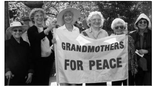
TOP: In Philadelphia, Pennsylvania, the Philadelphia GFP have their first event as a group, a Tax Day protest against the Iraq War, at Rittenhouse Square, April 17, 2006.