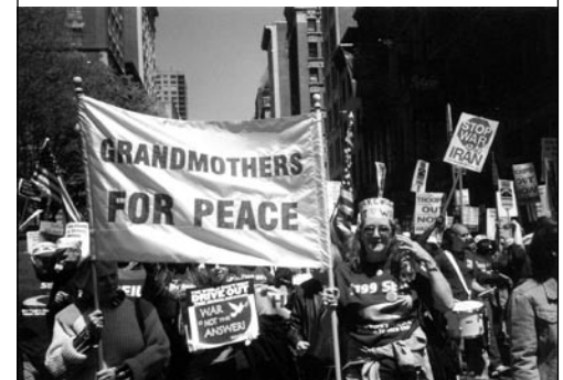
BOTTOM: New York City, New York: The Philadelphia GFP participate in the April 29, 2006, anti-war rally.